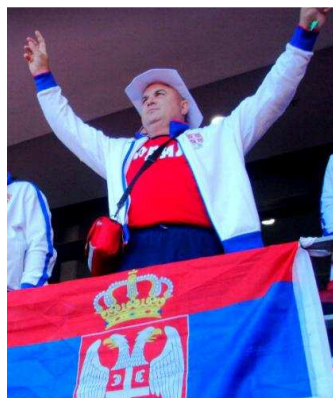
Serbian and German fans